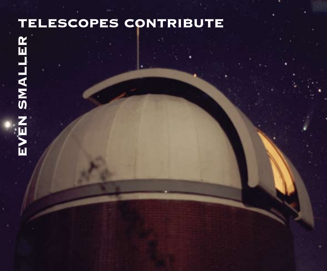
The dome of the 30-inch telescope at UF's Rosemary Hill Observatory in Bronson, Fla.

While all of the attention goes to the world's biggest telescopes, in the right hands even a modest telescope closer to home can reveal new discoveries.