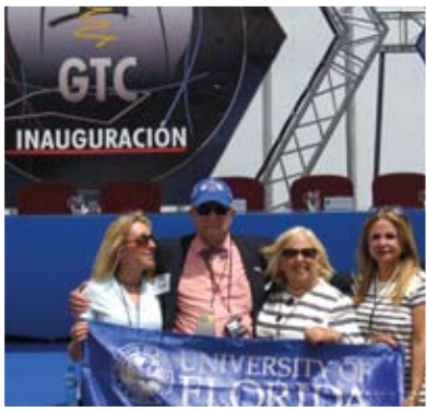
Several members of UF's Hispanic Alumni Association attended the dedication.