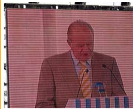
Remarks by Spain's King Juan Carlos I were broadcast on a big screen above the stage.