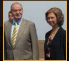
King Juan Carlos I & Queen Sophia

Most of the time, the observatory at the peak of the Roque de los Muchachos is as empty as it is otherworldly. A single dormitory houses the astronomers who work on the 17 out-sized telescopes sprinkled across the mountaintop. Few tourists bother to visit the tiny island of La Palma, home to one of the European Northern Observatory's two bases in the Canary Islands. Fewer still brave the 90-minute drive up the narrow road that climbs in hairpin turns past the island's stucco homes and a thick forest before summiting at nearly 8,000 feet amid an eerie profusion of silvery telescopes.