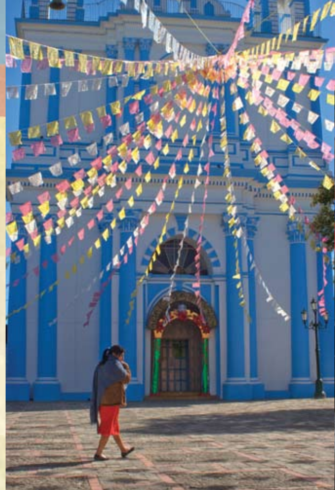
Church in Mexico.